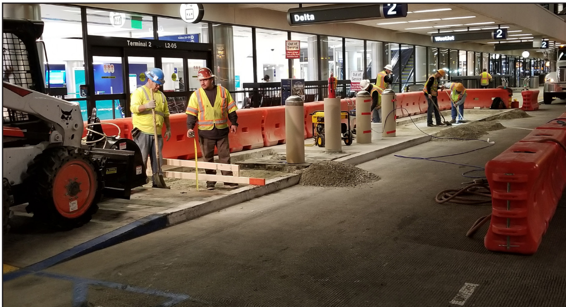
Bollards progress during Phase II: Departures Level, Terminal 2